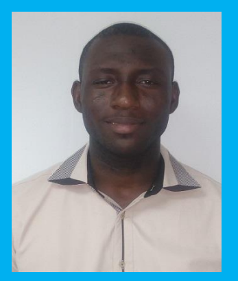
HaastrupBusuyi - Nigeria