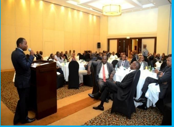
Chief Guest addressing participants